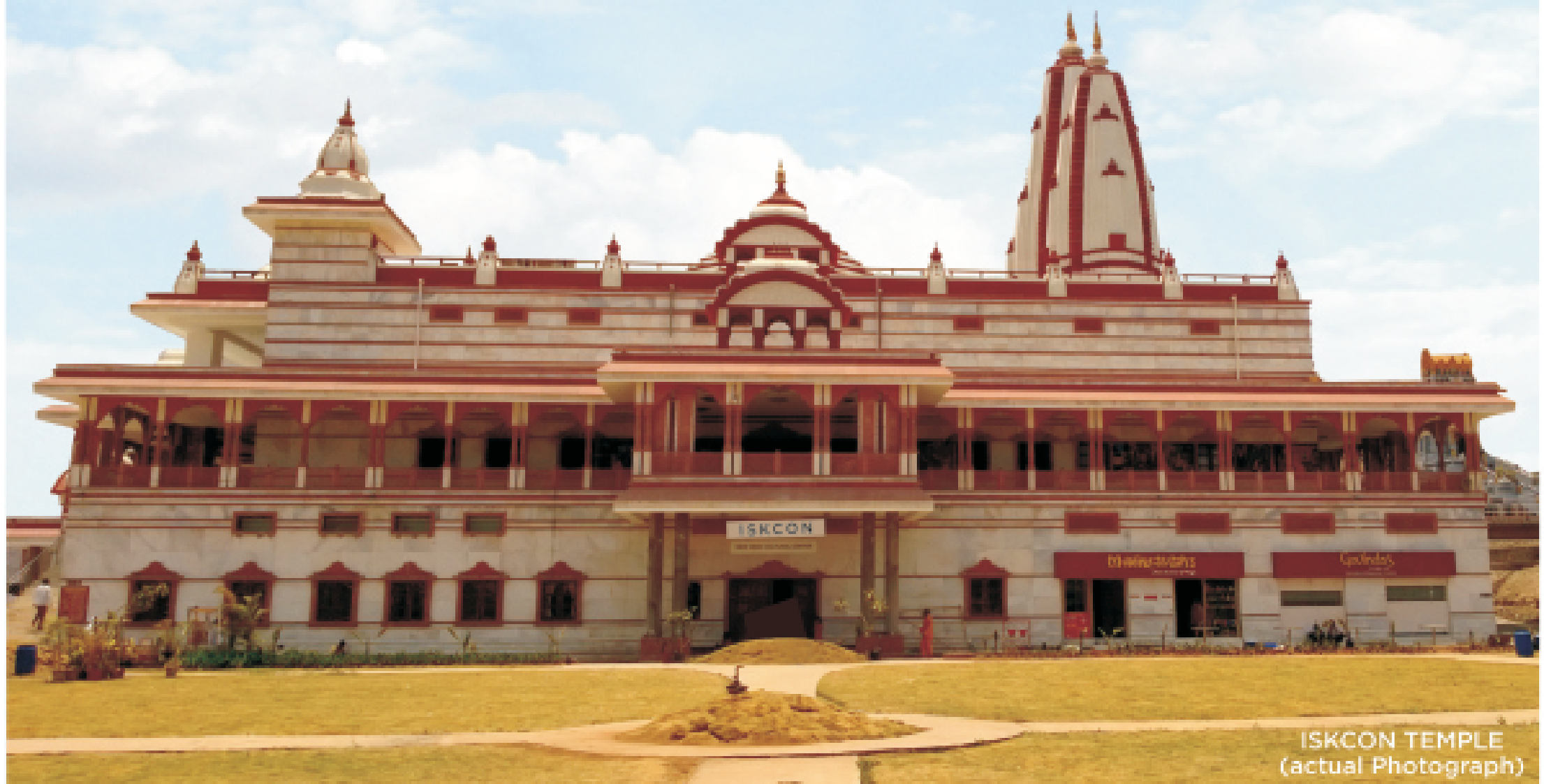
ISKCON TEMPLE (actual Photograph)